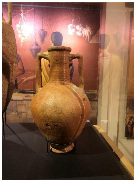
Fig. 4: Olive oil bearing amphora

Photo taken January 2020 by M. Reininger at Pompeii Exhibit at The Leonardo Museum in Salt Lake City, UT