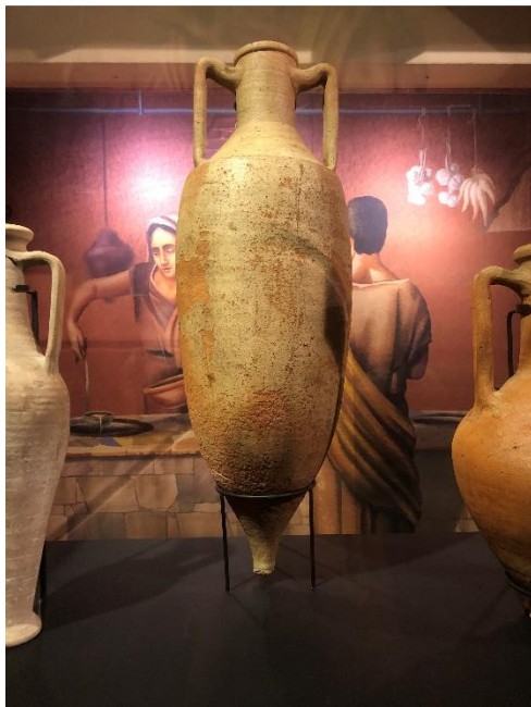
Fig. 5: Wine bearing amphora

Photo taken January 2020 by M. Reininger at Pompeii Exhibit at The Leonardo Museum in Salt Lake City, UT