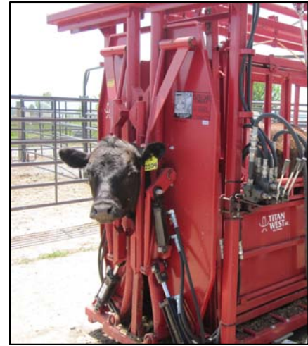
Figure 2. Automatic squeeze chute.

Use automated equipment that minimizes the operational force needed such as automatic squeeze chutes (Figure 2) when working with livestock. Use feeding equipment and bale handlers for handling feed and hay.