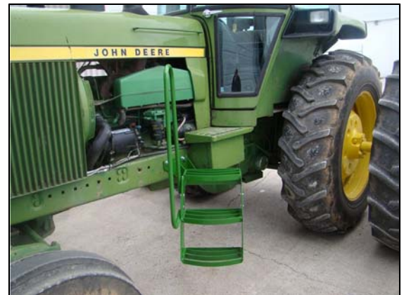
Figure 3. Additional tractor steps.