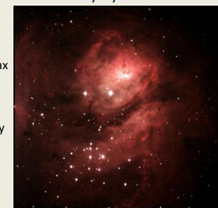
Figure 3 – The Lagoon Nebula imaged from the USU Observatory by Matt Wallace

Northern Utah Light Pollution Image by P. Cinzano, F. Falchi (University of Padova), C. D. Elvidge (NOAA National Geophysical Data Center, Boulder). Copyright Royal Astronomical Society. Reproduced from the Monthly Notices of the RAS by permission of Blackwell Science.