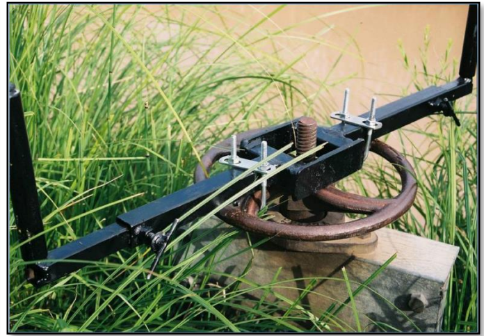
Figure 1. Handles added to irrigation headgate to accommodate opening with prosthesis.

Prostheses in Farming: Although innovations in prosthetic devices are occurring at a rapid pace, farmers and ranchers can experience difficulty in finding a prosthetic device that meets the demands of the farm. 3 Prosthetic devices are often not durable enough to hold up to farm work tasks and exposure to the weather and elements. Find a prosthetist that is willing to build what you need and train you on how to use the device on the farm.