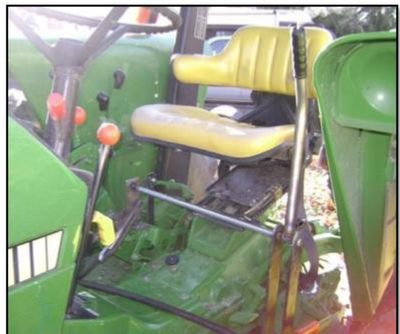
Figure 3. Hand control on foot pedal.