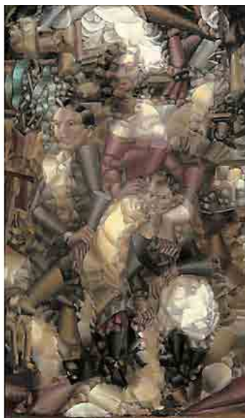
Fig. 1. Study for Three Portraits by Fernand Léger, 1910–11. Oil on canvas. Milwaukee Art Museum. < http://www.mam.org/collections/modern_detail_leger.htm >.

From his first days as a artist, Léger’s work was revolutionary and eye-opening to the world of art it entered as he explored new genres of Cubism within his paintings (see Fig. 1); so too was Cather’s early short story revolutionary as it demonstrates a woman owning her sexuality, courage, and talent without excuse in a world that is not yet ready to understand, as shown through the characterization of Don Hedger. Just as in Shadows on the Rock where ’Toinette and Le Ber are in control of their sexuality, so too is Eden in control of how she chooses to use her body.