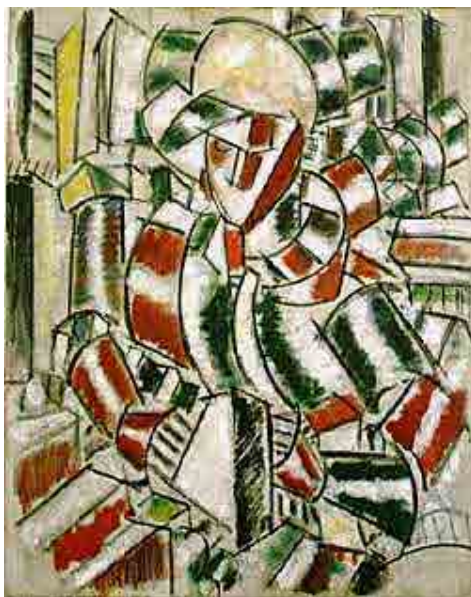
Fig. 6. La Femme en rouge et vert (The Woman in Red and Green), 1914, oil on canvas, 39 3/8" x 31 7/8" (100 x 81 cm), Musée National d'Art Moderne, CNAC Georges Pompidou, Paris; rpt. in Gaston Diehl, F. Léger (Hungary: Bonfini P, 1985) 17.

“Coming, Aphrodite!,” three paintings contain subject matter and similar description to Molly Welch, her costume, circus and acrobatics. In 1914 Léger painted La Femme en