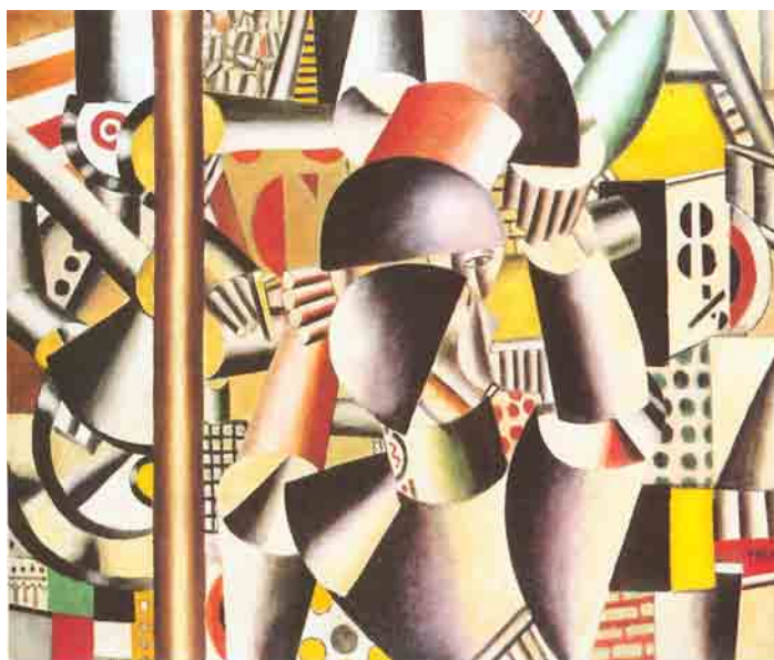
Fig. 8. Les Acrobates dans le cirque (Acrobats at the Circus), 1918, oil on canvas, 38 ¼” x 46 in. (97 x 117 cm), Kunstmuseum, Basel; rpt. in Serge Fauchereau, Fernand Léger: A Painter in the City (New York: Rizzoli, 1994) 55.

Part of Hedger’s purpose in telling the story “The Forty Lovers of the Queen” to Eden later that evening is to try to reassert his power over Eden, power that he recognizes he lost at the circus, or perhaps realized he never had. Hedger wants to show Eden he can shape a female’s story from his own perspective within his verbal storytelling as another type of creative depiction separate from his art. But Eden will once again show Hedger that she will not allow him, or any other male, to ever have that control. In “Coming, Aphrodite!” Eden later comes up to join Hedger on the rooftop and Cather describes the commencement of their love affair: