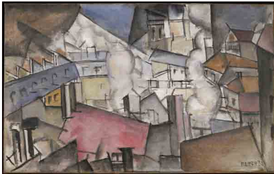
Fig. 2. Fumées sur les toits (Smoke over the Rooftops), 1911, oil on canvas, 60 x 93 cm, The Minneapolis Institute of Arts; rpt. in Yvonne Brunhammer, Fernand Léger: The Monumental Art (Italy: Grafiche, 2005) 31.

descriptions in her short story, so too do Léger's paintings seem reminiscent of New York City. This connection can be seen in Léger's 1911 painting Fumées sur les toits , translated as Smoke over the Rooftops (see Fig. 2).