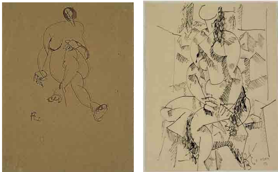
Fig. 4. Seated Female Nude (left) by Fernand Léger, 1909-11, ink on brown wove paper, 12 ½ x 9 5/8 in., Norton Simon Museum, The Blue Four Galka Scheyer Collection. http://www.nortonsimon.org/collections/browse_artist.asp?name=Fernand+L%26%23233%3Bger .

suggest action as seen in Seated Female Nude and Seated Nude (“Coming” 100; See Figs. 4 & 5).