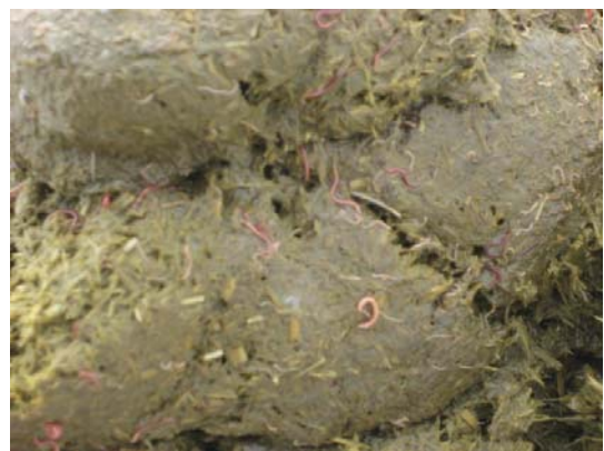
Figure 1. Small strongyles in manure after deworming.

Pin worms are found in horses of all ages. Horses ingest eggs from feed or water contaminated with manure, or by licking walls or fences. The larvae mature in the horse's intestines, then as adults, the females move to the rectum and deposit sticky eggs around the anal area. The damage caused by pinworms is external due to intense itching and scratching of the tail area and loss of tail hair. A broad spectrum of dewormers will work on this parasite.