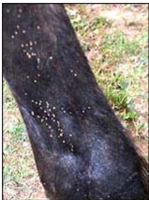
Figure 3. Yellow spots on legs are Bot eggs deposited by Bot fly.

The adult bot fly lays eggs (Figure 3) on the horse's legs, chest, throatlatch or chin areas. Some hatch without stimulation by the horse but others hatch due to licking. The larvae burrow into the horse's mouth tissue causing ulcers. After about 3 weeks they emerge and move to the stomach (Figure 4) and small intestine where they suck blood, causing inflammation and ulceration of the lining.