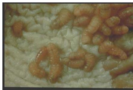
Figure 4. Bot larvae in the horse's digestive tract.

Strongid C is a dewormer that kills the larval stage of internal parasites. This dewormer is given daily and is the only dewormer that kills the larval stage. This program includes giving an Ivermectin product on the day the horse goes on Strongid C and every 6 months after. Ivermectin is given to kill bots and