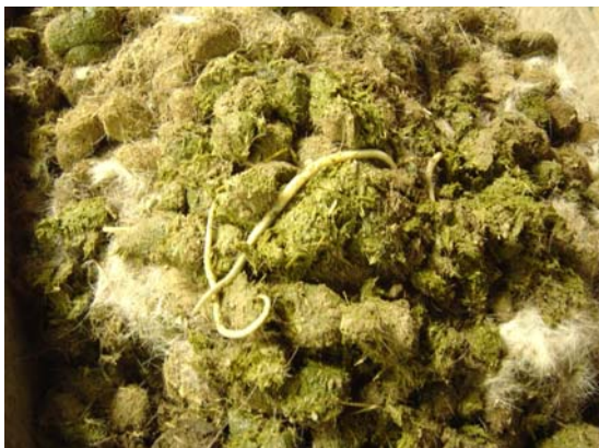
Figure 2. Round worms (Ascarids) from young horses that were not properly dewormed.

These internal parasites are mainly a problem in young horses under a year of age. The round worms (Figure 2) cause poor growth, rough hair coat, pot belly, chronic respiratory problems and sometimes death. Most of their damage is caused by their migration to the liver and lungs. In the gut, the round worms compete for nutrients and suck blood, growing 12 to 15 inches in length. Some classes of dewormers are showing signs of ascarid resistance including Ivermectin, (pyrimidine) Pyrantel Pamoate and Moxidectin in some areas of the country.