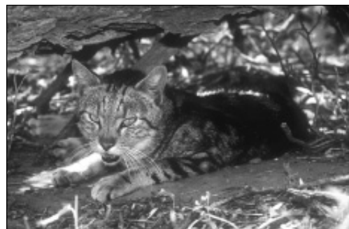
House cat.

Studies of cat impact often have drawn a distinction between 2 kinds of cats. On the one hand, domestic cats have been viewed as pet or house cats that live in close connection with a household where all their ecological requirements are intentionally provided by humans (Moodie 1995). Such cats do not rely on hunting for food, but they may still impact on native fauna by their predatory activities. On the other hand, feral cats are free-living; they have minimal or no reliance on humans, and survive and reproduce in self-perpetuating populations