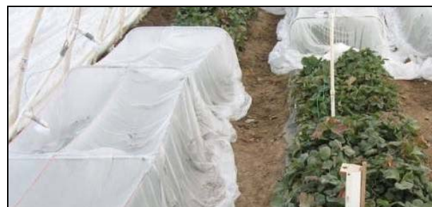
Figure 3. Low tunnels within a high tunnel.

sufficiently reduce the temperature then the side walls can also be opened (Figure 2). Doors should be closed in the late afternoon to retain heat through the night time. Low tunnels placed over individual rows of crops within the high tunnel can add an additional “temperature lift” to prevent cold damage at night (Figure 3). Low tunnels also require careful ventilation to prevent extreme high temperatures. Without proper ventilation of both high and low tunnels, temperatures in a Northern Utah high tunnel have exceeded 120°F on a sunny day in early March.