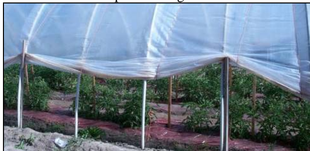
Figure 2. Side ventilation of a tomato high tunnel.

Opening the end doors or vents is the first step in ventilation and temperature regulation. If this does not