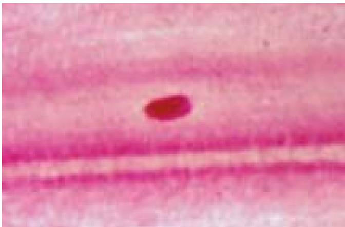
Fig. 3. Onion thrips egg stained pink with acid fuchsin within onion leaf. 1