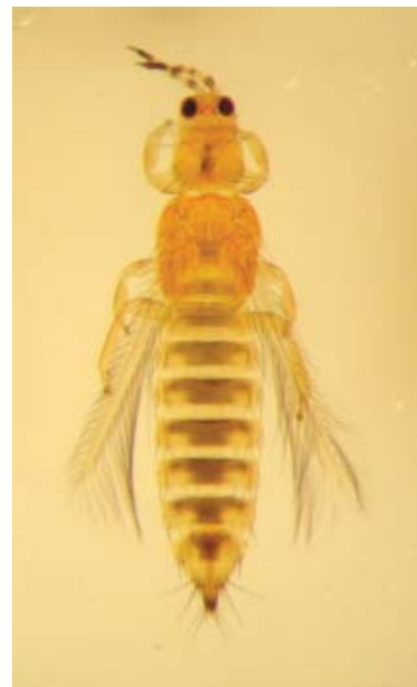
Fig. 7. Western flower thrips adult is darker yellow in color and slightly longer than onion thrips; also, it has 8- rather than 7- segmented antennae. 2

Other species of pest thrips are found on onions in Utah. Of these, the western flower thrips (WFT), Frankliniella occidentalis , is the most common. Thrips surveys conducted in Utah onion fields since the 1990s have found WFT numbers to be 10 to 100 times lower than onion thrips. WFT is slightly longer (0.08 inch or 2.0 mm) and darker yellow than onion thrips (Fig. 7). Viewed through a microscope, WFT can be distinguished from onion thrips by its 8-segmented antennae and longer setae (hairs) on the segment just behind the head (prothorax). WFT reproduces sexually; males and females are common. WFT densities in onion are higher in the late summer, especially on plants that have bolted and produced seed. In Utah, WFT are much less important to onion crop damage than onion thrips.