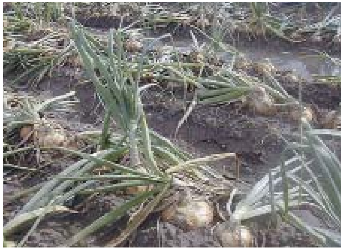
Fig. 5. Heavy thrips feeding injury causes onions to wither and senesce early. 1