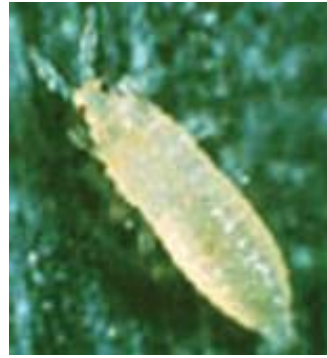
Fig. 4. Young larva is white to pale yellow in color with elongate body. 3