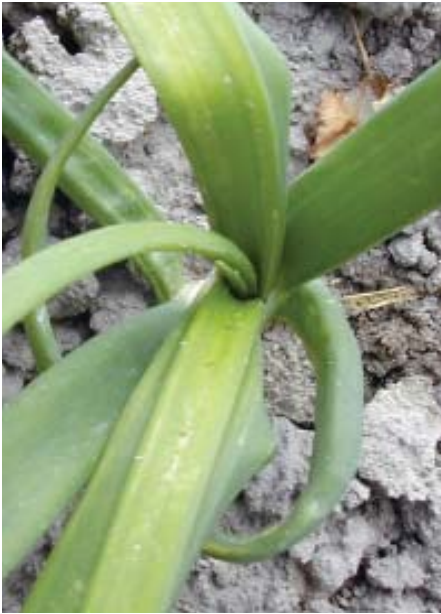
Fig. 8. Thrips prefer to hide in the lower neck of onion plants. 1