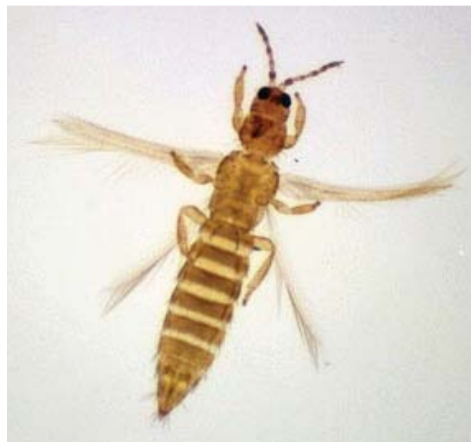
Fig. 2. Adult onion thrips have fringed or hairy wings and 7-segmented antennae. 2

unsustainable management. Life history characteristics of onion thrips that enhance their pest status include a short generation time, high reproductive potential, asexual reproduction by females (parthenogenesis), and occurrence of protected, non-feeding life stages. Recent research has shown that the majority of onion thrips on a plant are in the non-feeding egg stage (60-75% of total population on an onion plant during late June to August), and thus, not exposed to insecticides and other suppressive tactics. Multi-pronged pest management strategies that boost onion plant health and tolerance to thrips, in addition to suppressing thrips densities, have proven the most sustainable and economically viable.