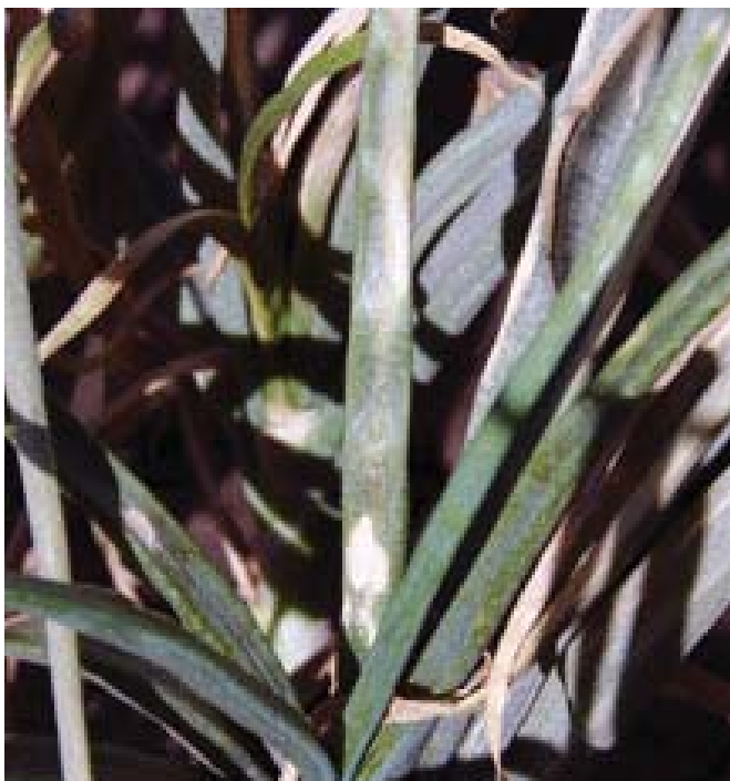
Fig. 6. Iris yellow spot virus (IYSV) spindle-shaped lesions on onion leaf. 4

Onion thrips can vector plant viruses. Within the last 10 years, the introduction of iris yellow spot virus (IYSV, a tospovirus) into Utah and other western states has caused significant economic losses to the onion industry. IYSV causes lesions on onion leaves and flower scapes. Lesions are straw- to tan- colored, and spindle- to diamond-shaped (Fig. 6). Under some conditions, the disease may spread rapidly causing plants to senesce early and dramatically reduce bulb size. Onion thrips can also vector other viruses, such as tomato spotted wilt virus (TSWV) and impatiens necrotic spot virus (INSV), and although these can be economically important to greenhouse and nursery plants, they are not a concern on onions.