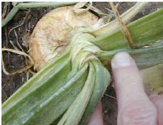
Fig. 1. Thrips feeding injury appears as white to silvery patches and streaks on leaves. 1

Onion thrips, Thrips tabaci (Order Thysanoptera, Family Thripidae), is a key insect pest in most onion production regions of the world. Immature and adult thrips feed with a punch-and-suck behavior that removes leaf chlorophyll causing white to silver patches and streaks (Fig. 1). Thrips populations increase rapidly under hot, arid conditions and can lead to economic crop loss. The early bulb enlargement stage of onion growth is the most sensitive to thrips feeding. Insecticides have been the primary tactic for their management; however, repeated applications often lead to resistance in the thrips population, suppression of natural enemies, and