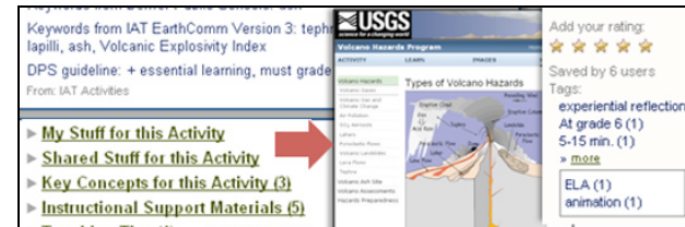
Figure 1. A screen capture of some of the features in the CCS interface.