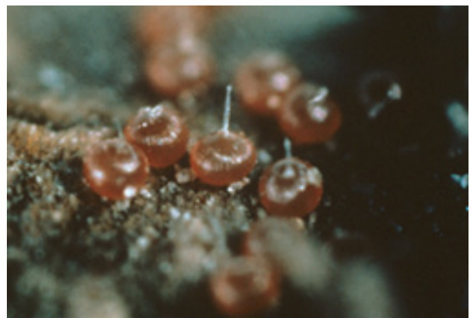
Eggs are spherical with a slender stalk on top.