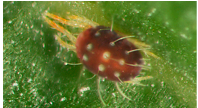
The female European red mite has a red body with white legs and hairs and spots on her back.