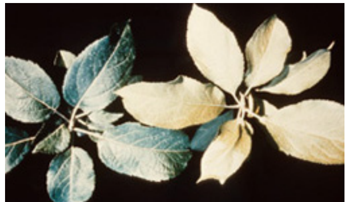
Feeding injury by European red mite to apple leaves on the right.

The European red mite is native to Europe and was first introduced into the Pacific Northwest in the early 1900s. Since then, it has spread and become established throughout the United States and Canada.