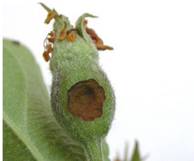
Fig. 2. Apple fruitlet injured by fruitworm feeding.

The speckled green fruitworm generally does not cause serious damage, though high densities can cause localized defoliation. The larva (Fig. 1) feeds on flowers, leaves, and fruit. Feeding damage to early-season fruit, such as young apples and cherries (Fig. 2), results in severe malformation of the mature fruit (Fig. 3). Beat-samples (shaking or banging limbs over a light-colored tray) are a good way to determine if fruitworm larvae are present.