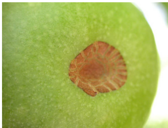
Fig. 3. Mature apple with fruitworm injury.