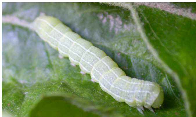
Fig. 1. Speckled green fruitworm larva.

In Utah, the speckled green fruitworm (Order Lepidoptera, Family Noctuidae) is a common pest of fruit trees. The larvae (caterpillars) hatch in spring and begin feeding on buds, flowers, leaves and young fruit. The larvae can also feed on a variety of ornamental trees, such as willow, birch, poplar, alder, and maple.