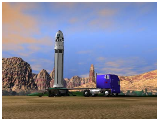
Figure 1. Conceptual Vehicle Illustrating Simplified Transportation and Logistics Support

The concept is a modular scalable suborbital vehicle capable of road, air or rail transport into most areas of the planet. The vehicle uses multiple redundant pressure fed propulsion modules providing high reliability.