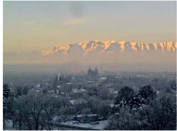
Figure 1. Haze in Logan, Utah.

Ammonia – combines with NO x to form ammonium nitrate, a small particulate matter (PM 2.5 ). Ammonium nitrate is the primary source of haze in northern Utah (Figure 1). Ammonia also contributes to acid rain. Fertilizer and animal waste are the primary agricultural sources of ammonia. The addition of carbon sources such as straw to manure, and rapid incorporation of fertilizer and manure reduce ammonia emissions.