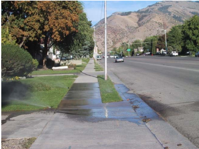
Figure 7. Misaligned sprinklers spraying across sidewalk and into road.

waterways by washing pollutants into the sewer system.