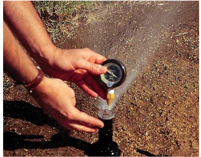
Figure 9. Testing sprinkler water pressure with a pitot tube and gauge.

problem causing reduced sprinkler coverage and uniformity.