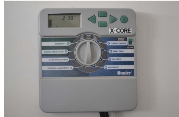
Figure 10. A typical automatic sprinkler controller.

http://extension.usu.edu/files/publications/factsheet/pub_975158.pdf