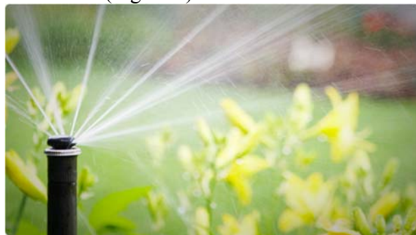
Figure 2. Hunter MP rotator nozzles such as this one should all match within a zone.

There are many options available for sprinkler heads and nozzles and some of these are better at watering evenly than others. Consider replacing inefficient sprinkler heads or nozzles with more efficient products. Rainbird RN™ series nozzles or Hunter MP™ rotator nozzles are just two of the choices of high efficiency nozzles available to consumers (Figure 2).