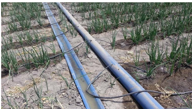
Drip irrigation being used for onions.

Different irrigation methods are commonly used to irrigate onions, each with different management considerations. Historically, furrow irrigation was the method of choice. Furrow irrigation results in large fluctuations in soil moisture, nutrient leaching, and low water use efficiency. Drip irrigation is becoming more widely used to grow onions. The advantages of drip include better fertilizer management, reduced water use, improved pest and weed control, and increased onion bulb size, uniformity, and marketable yield. Regardless of the irrigation system used, there are some basic principles to understand that will help ensure proper irrigation. This fact sheet will discuss these basic principles.