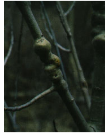
Figure 6. Aspen galls.

Aspen galls. Several insects cause swellings in stems, shoots, leaves and petioles of aspens, called galls (Figure 6). Most galls cause local injury that does not affect tree growth or survival. Some premature leaf drop can occur. Management is rarely justified, and may not be practical, because insects in galls are not vulnerable to insecticides. Adults emerging from the galls to lay eggs may be effectively controlled with Dursban. Orthene or acephate has been used with varying success.