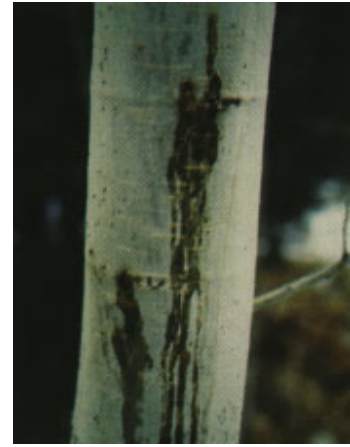
Figure 2. Bleeding wound with frass ( Saperda ).

Aspen leafminer larvae feed on leaves and form blotches or serpentine patterns which are unsightly (Figure 5). Feeding damage may cause the leaves to fall early, but in most cases leafminer infestations are not severe enough to significantly affect tree health. Control of leafminers is not always warranted. If treatment is deemed necessary, treat foliage when leaves are half-sized, or in May or June when mines are first observed. Homeowners may consider approved formulations of Orthene, Sevin, Cygon, or Lindane. However, check labels for names of trees which can be treated.