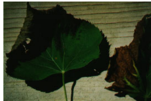
Figure 10. Leaf scorch.

Leaf scorch is a foliar problem caused by insufficient soil moisture. In aspens leaf scorch is usually limited to ornamental situations. Leaf margins are killed (Figure 10) when the tree cannot supply enough moisture to the leaves during hot, dry weather, especially when it is windy. Leaf scorch is aggravated by iron deficiency. Proper watering—enough to saturate the tree’s root zone—can prevent further damage.