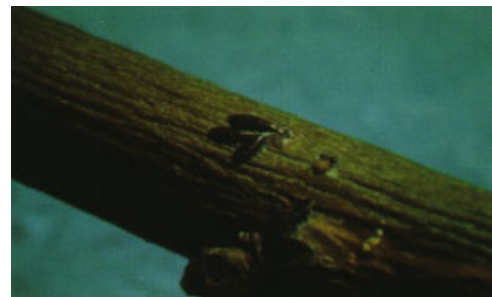
Figure 4. Oyster shell scale adults encrusting twig.