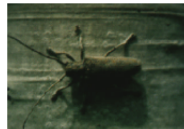
Figure 1. Adult Saperda .

developing larvae which feed in the trunk of the aspen for perhaps several years. Their tunneling often weakens the wood of the trunk and allows invasion of canker and decay fungi. The tree may ultimately break in a wind or snow storm. Larval