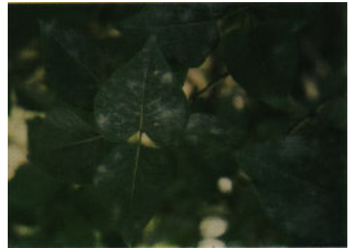
Figure 9. Powdery mildew.

Powdery mildew produces a greyish coating over the leaf. This powdery mass consists of the thread-like mycelia and spores of the fungus (Figure 9). Powdery mildews are unusual in that unlike most fungi they grow well under dry conditions. Although it detracts from the appearance of leaves, powdery mildew causes little damage to aspens, and control is usually not justified.