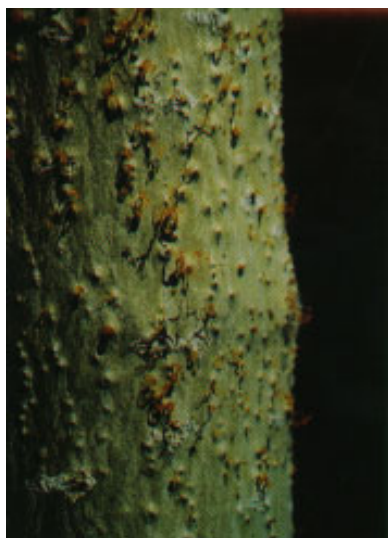
Figure 11. Cytospora canker.

Cytospora canker is one of the most common diseases affecting aspen twigs and stems in ornamental situations. This fungus invades wounds—those caused by humans as well as those made by insects, branch rubbing, and other “natural” causes. This fungus is a parasite of weak and dying trees in natural stands, and often attacks stressed trees in the landscape. Once Cytospora invades a wound, it often girdles a branch by killing the cambium (Figure 11). Vigorous trees, however, can limit the