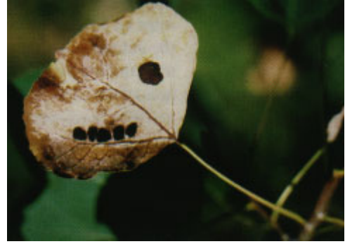
Figure 8. Ink Spot.

Ink spot is a leafspot restricted to high elevation aspen stands. This leafspot is easily distinguished from other foliar problems by the presence of large, flat, black fungal structures on the leaves. These spots resemble drops of ink or tar (Figure 8). Later in the summer, the black structures may fall from the leaves, leaving roundish holes in the leaf. This disease is not a problem of ornamental aspens in lower valleys, but is often mis-named by homeowners when they see aspen leaf spot. Control is not warranted for ink spot.