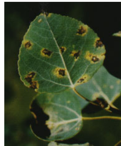
Figure 7. Marssonina leaf spot.

Aspen Leaf Spot. The most common foliar problem on aspen is aspen leaf spot caused by the fungus Marssonina populi . This fungus causes dry, brownish lesions with yellowish borders (Figure 7). Margins are often irregular and indistinct, and not restricted by veins as are those caused by iron chlorosis. Infection is favored by wet weather, especially when the aspen leaves are emerging from the buds. During particularly wet springs, extensive infection can occur throughout aspen forests, resulting in massive defoliation and a loss of the delightful fall color. After several years of defoliation the disease may even kill aspens.