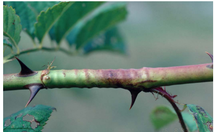
Fig. 4. A multiflora rose cane showing spiral grooves caused by girdling of a rose stem girdler larva 4 .

Prune out and destroy infested canes in spring through summer to remove larvae. Prune below the point of insect boring activity, or remove entire canes. Second-year canes generally wilt before harvest and should be removed at that time. Infested canes should be destroyed by burning, composting, or burying in soil at least 2 inches deep to prevent adults from emerging. If an infestation is substantial, pruning should be supplemented with chemical control.