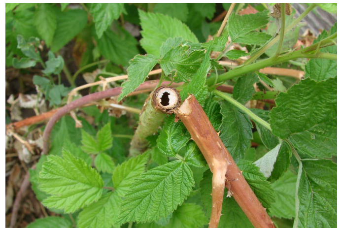
Fig. 2. A raspberry cane with damage from tunneling by a rose stem girdler larva. The cane broke at the girdling site 2 .

The rose stem girdler is a small flat-headed, metallic beetle ( Coleoptera ) in the Family Buprestidae (Fig. 1). It was first introduced into the eastern U.S. from Europe in the early 1900s in infested roses. It was first reported in Utah in American Fork in 1955. Today, it is a common cane-boring pest of raspberry, blackberry, and wild rose in central and northern regions of the state. It has been observed in Rich, Cache, Box Elder, Weber, Davis, Salt Lake, Utah, Wasatch, and Sanpete counties. Larvae tunnel in the canes causing gall-like swellings and cane breakage (Fig. 2). The rose stem girdler can dramatically reduce stands of red raspberry canes, and even kill out a planting.