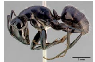
Fig. 14. C. laevigatus . 1