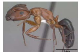
Fig. 18. C. sayi . 1