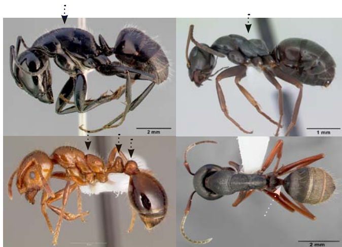
Fig. 4. Examples of petiole and thorax variation in ants. Top left: smooth, rounded thorax ( Camponotus laevigatus ); bottom left: two-node petiole ( Solenopsis invicta , imported red fire ant); top right: uneven thorax ( Formica fusca ); bottom right: single node petiole and constriction between thorax and abdomen ( C. modoc ). 1

Like butterflies and moths, ants have a complete life cycle consisting of an egg, larvae (grub-like), and a pupal stage (cocoon) that develops into an adult. Carpenter ants start new colonies by swarming, or a mass flight of winged male and female ants. Large groups of ants are cued to fly by pheromones released from glands on the male ants. After the female ant has successfully mated, she drops to the ground, breaks off her wings, and begins to search for a suitable site to colonize. Once a site is selected, the queen will lay up to 20 eggs which eventually hatch into legless larvae that the queen will feed from energy reserves stored within her, and from the breakdown of the flight muscles.