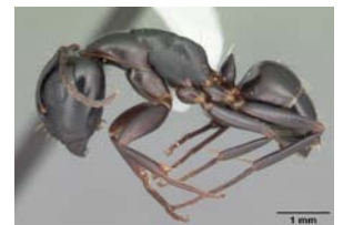
Fig. 19. C. nearcticus . 1