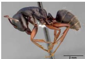
Fig. 15. C. modoc . 1