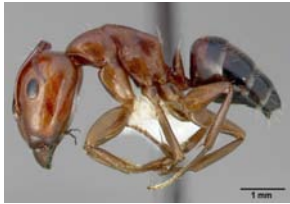
Fig. 11. C. essigi . 1