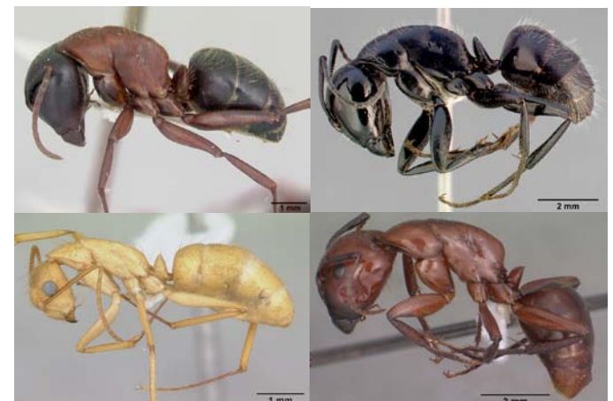
Fig. 5. Examples of color variation among carpenter ants ( Camponotus spp.). Top left: ( C. noveboracensis ) 1 ; bottom left ( C. balzani ) 1 ; top right ( C. laevigatus ) 1 ; bottom right ( C. shaefferi ) 1 .