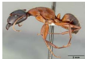
Fig. 16. C. semitestaceus . 1