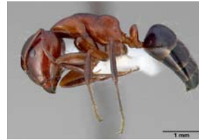
Fig. 13. C. hyatti . 1