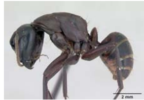
Fig. 12. C. hurculeanus . 1