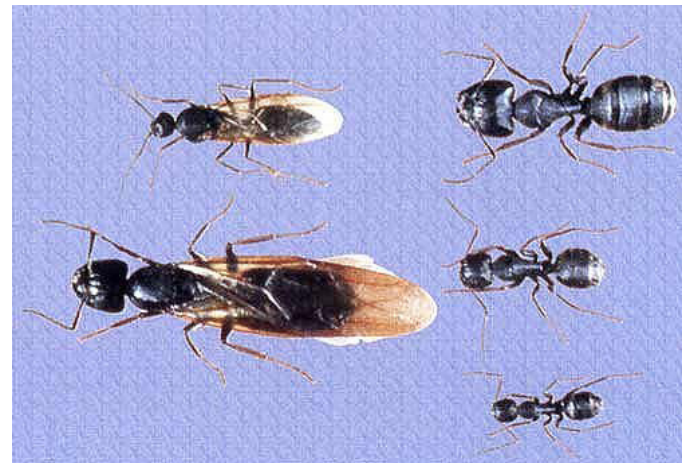
Fig. 2. Polymorphism (different body types) in carpenter ants. 2 Top left: winged reproductive male; bottom left: winged reproductive queen; right: different sizes of worker ants within the same colony.

All aspects of carpenter ants are not negative. Most play vital roles in maintaining a healthy environment. Carpenter ants are voracious predators in the forest ecosystem. They often consume large prey including stink bugs, leaf beetles, and spittle bugs. They also scavenge on dead insects, and prefer sweet foods such as honeydew from aphids, or sugars from fruits. Ants help speed the decomposition of wood by perforating wood cells allowing moisture and other wood decaying organisms to invade. Ants are also a food source for many birds and animals.