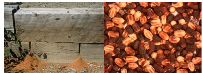
Fig. 8. Comparison of ant and termite frass. Left: carpenter ant frass (sawdust-like) 6 ; right: drywood termite pellets (6-sided, hard, woodlike pellets, ~1mm long) 7 .