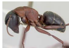
Fig. 17. C. noveboracensis . 1