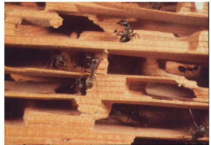
Fig. 7. Carpenter ant tunnels. 5