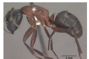
Fig. 20. C. vicinus . 10