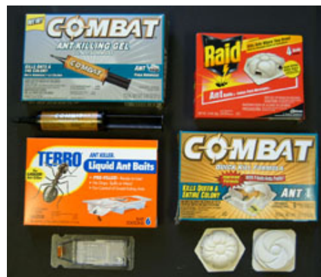
Fig.10. Examples of insecticide baits. 9

In Utah there are 427 products registered to treat carpenter ants, available as aerosols, baits, dusts, granules, and sprays (mixable and ready-to-use). Use the one most appropriate for your needs. Active ingredients in products labeled for this purpose include: abamectin, acephate, bendiocarb, bifenthrin, boric acid, chlorpyrifos, cyfluthrin, cypermethrin, D-phenothrin plus tetramethrin, deltamethrin, diazinon, esfenvalerate, fipronil, hydramethylnon, imidacloprid, permethrin, propetamphos, propoxur, sulfuramid, synergized pyrethrins, and tralomethrin. Again, it is strongly recommended that homeowners contact a professional pest control company to treat all colonies. For home use, baits are a great way to reduce carpenter ant populations, but may not completely eliminate the whole colony (Fig. 10). Baits are slow-acting allowing ants to take the chemical back to the nest and feed other ants--give it time--and do not kill ants feeding on baits.