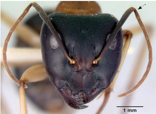
Fig. 1. Front view of a worker carpenter ant head ( Camponotus perthiana ). 1 The arrow indicates the elbowed antennae of ants.