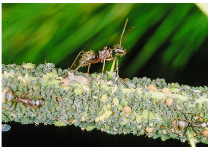
Fig. 9. Carpenter ants often tend aphids for honeydew. 8

Carpenter ants tend various insects (e.g., aphids and scales) for their sugar-rich honeydew excretions (Fig. 9). Treating soft-bodied insects like aphids with a horticultural oil, dust or insecticidal soap will eliminate a favorite food source of carpenter ants. In addition, vacuuming and regular cleaning will help keep ants from scavenging for food in the house and will reduce the temptation to colonize in wall voids.