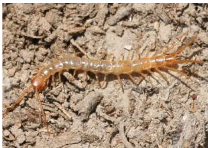
Fig. 1. Giant desert centipede, Scolopendra polymorpha . 1

Habitat. Centipedes like to be in secluded, damp, and cool places because they easily lose water. Outside they like to be under cool places including under rocks, leaves, rubbish, and in organic matter such as compost. Inside they are likely found in damp basements, cellars, bathrooms and anywhere else that is damp. Centipedes like to overwinter in these types of places. However, only the house centipede is known to remain inside year round.