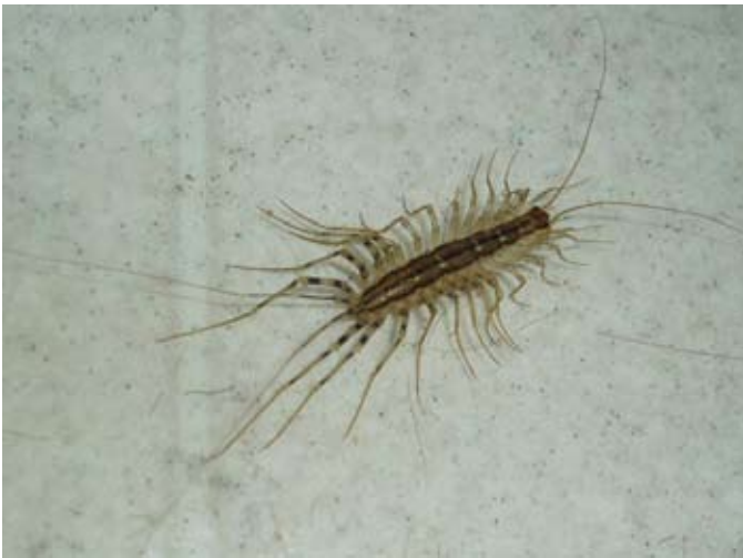
Fig. 3. The house centipede, Scutigera coleoptrata , can be a common indoor pest. 3

Centipedes are generalist predators, meaning they eat a wide variety of prey. They eat most anything that is small enough and soft bodied, which includes insects and other small animals. Because they eat almost any other small organism, including many common pests, centipedes are considered beneficial. However, many people consider them a nuisance because of their appearance and potential for bites. Centipedes are capable of biting humans, but this is generally of very little concern. Small centipedes are usually not able to penetrate skin, and bites from larger centipedes usually only cause minor irritation similar to mild bee stings. Centipede bite symptoms should subside within a few hours.