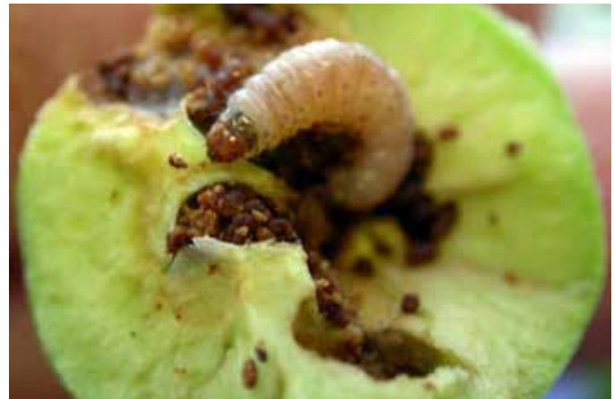
Fig. 2. Codling moth larva

Codling moth (Order Lepidoptera, Family Tortricidae) is the most serious pest of apple and pear worldwide (Fig. 1). In most commercial fruit producing regions and home yards in Utah, fruit must be protected to harvest a crop. Insecticides are the main control tactic. There are new insecticides available, many of which are less toxic to humans and beneficial insects and mites than earlier insecticides. For commercial orchards with more than 10 acres of contiguous apple and pear plantings, pheromone-based mating disruption can greatly reduce codling moth populations to allow reduced insecticide use. Effective biological control has not been possible because fruit is attacked by newly hatched larvae, which are protected from natural enemies once inside the fruit (Fig. 2). Sanitation methods can help reduce codling moth densities within an orchard, but alone cannot provide satisfactory control.