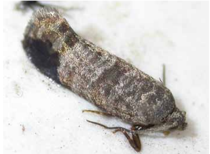
Fig. 1. Codling moth adult