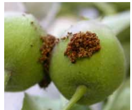
Fig. 4 Frass from codling moth exit