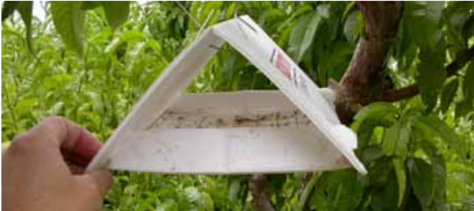
Fig. 5 Delta trap