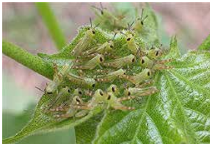
Newly hatched grasshopper nymphs

Note: Size is approximate, and depending on species, can vary by 1/4 to 1/2 inch.