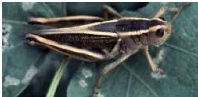
Whitney Cranshaw, CSU

Adults are 1¼ - 2" long, and prefer tall, lush, herbaceous vegetation, and reside in ditch banks, roadsides, and crop borders. This species can be a major pest in small grains, alfalfa, and corn. It is one of the first species to appear each season.