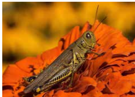
David Cappaert, MSU

Adults are 1¾" long, and live in fields, open woods and along the edges of water, and feed on grasses, weeds, and crops.