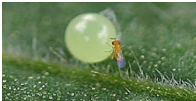
Trichogramma are tiny wasps that parasitize insect eggs (North Carolina Cooperative Extension).

Trichogramma wasps parasitize corn earworm eggs. The wasps can be purchased from vendors and released in the corn field. The timing of releases and maintenance of adequate wasp populations are critical to success. Wasps have been used with limited success in Utah.