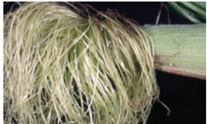
Corn earworm moths lay their eggs on fresh corn silk. Note the tiny white eggs stuck on the silks.