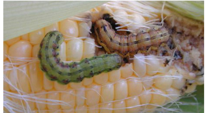
Larvae feed on corn kernels within the ear. Larvae vary in color from green to brown to black ( University of Minnesota ).

On corn, the newly hatched larva crawls down the corn silk and into the ear tip. It prefers to feed on the developing kernels in the ear, but will also chew on silks and leaves. On tomato and pepper, it tunnels into the fruits and chews on leaves. CEW strongly prefers corn to other