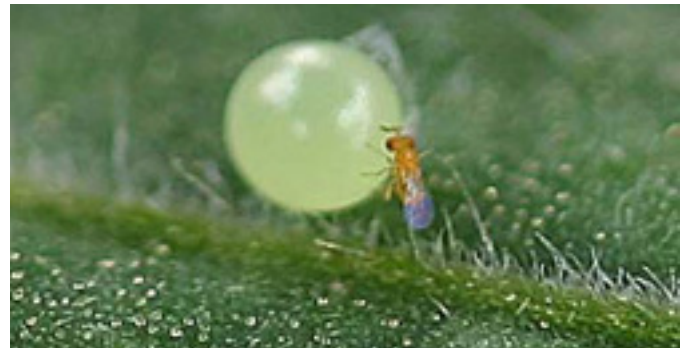
Trichogramma are tiny wasps that parasitize insect eggs (North Carolina Cooperative Extension).

Trichogramma wasps parasitize corn earworm eggs. The wasps can be purchased from vendors and released in the corn field. The timing of releases and maintenance of adequate wasp populations are critical to success. Wasps have been used with limited success in Utah.