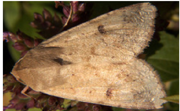
Moths have tan wings with a distinct spot and dark margin on each forewing.