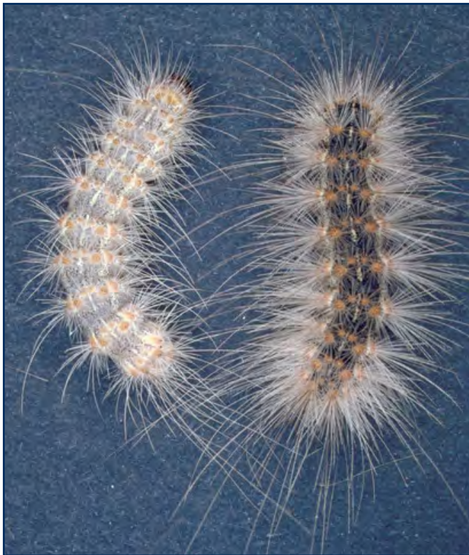
Fig. 3. Fall webworm ( Hyphantria cunea ) larvae can have great variability in their coloration. 1

In Utah there are over 140 products containing 29 different active ingredients (AI's) labeled for use on ornamental shade trees for fall webworm control. Examples of AI's include: acephate (1B), bifenthrin (3A), carbaryl (1A), chlorpyrifos (1B), imidacloprid (4A), permethrin (3A), and thiamethoxam (4A). The number and letter combinations following AI's indicate its chemical group. These groups are chemically similar insecticides that kill the target organism in a similar way, i.e., mode of action. Rotating insecticides with different chemical groups on a yearly basis can help reduce insect resistance build-up to an insecticide. For more information on insecticide mode of action and insecticide resistance, visit irac-online.org . Make sure the product you select contains the site, e.g., ornamental fruit or shade trees, to which you are going to apply.