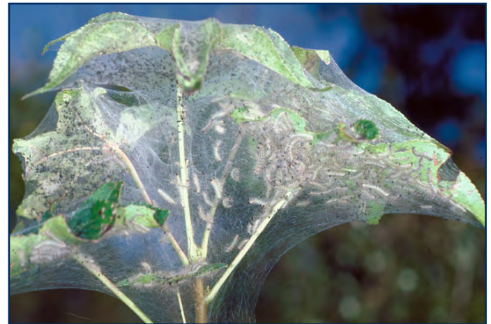
Fig. 2. Fall webworm ( Hyphantria cunea ) larvae feeding gregariously inside of a silken "tent." 1