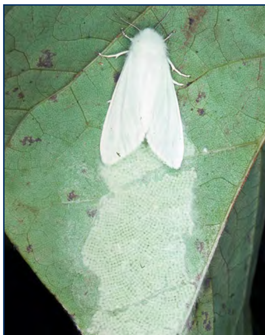
Fig. 1. Adult fall webworm ( Hyphantria cunea ) laying eggs on the underside of a leaf. 1

The fall webworm, Hyphantria cunea , is a common defoliator of ornamental and fruit trees in Utah. Starting around late July, the caterpillars, webbing, and damage become noticeable, particularly in some of the canyons adjacent to populated areas (Little Cottonwood canyon, Logan canyon, Provo canyon, etc.).