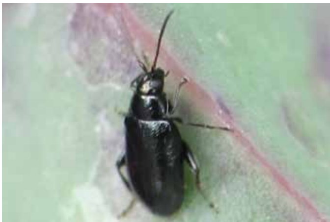
Western black flea beetle ( Phyllotreta pusilla ) is a small, shiny black species. It occurs throughout much of the western half of the northern U. S. and southern Canada. It has a considerably wider host range than other members of this genus.