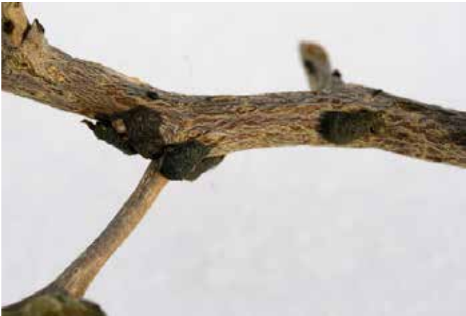
Sumac flea beetle egg masses laid on a skunkbrush twig. Unlike most species of flea beetles, sumac flea beetle females lay eggs in small masses on the twigs and leaves of their host instead of in the soil 11 .