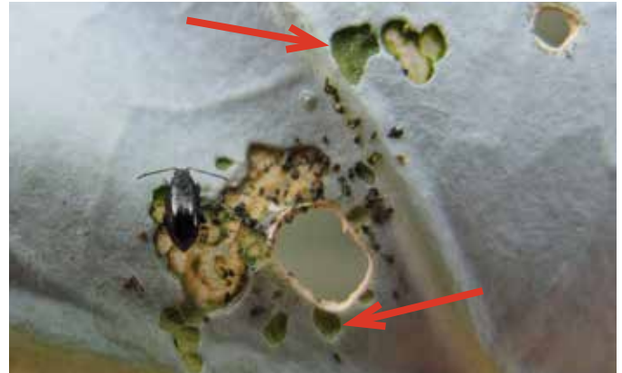
Fig. 5. Feeding by adult flea beetles can also cause pitting on plants that have thick waxy leaves such as on broccoli.

Leafy mustard greens are at high risk for unsightly shotholes and scars that can reduce marketability; however, for mature or less sensitive plants, more than 20% of the leaf area must typically be damaged before yields are reduced. In contrast, seedlings and small transplants are at high risk for damage, especially under heavy infestations (Fig. 6).