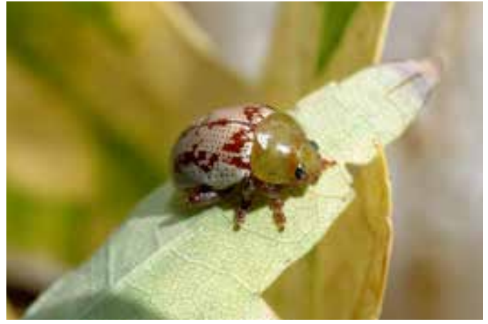
Sumac flea beetle ( Blepharida rhois ) is a moderate sized beetle. It has cream colored wing covers with irregular, wavy reddish markings and an orange prothorax. Overwintered adult beetles move to sumac in the spring shortly after bud break and feed on the emerging growth 10 .