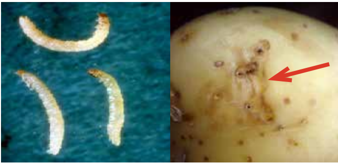
Fig. 2. Tuber flea beetle larvae (left) 1 create shallow tunnels on potato tubers (right) 2 .