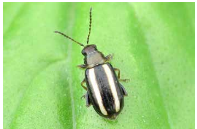
Palestriped flea beetle ( Sestena blanda ) is not only one of the most widely distributed flea beetles of North America, but also has the broadest host range. The palestriped flea beetle is one of the larger species (1/8 inch long).