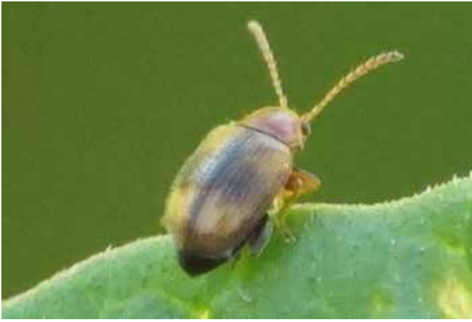
Tobacco flea beetle ( Epitrix hirtipennis ) commonly feeds on eggplant, tobacco, and potato. It has bronze coloration and is predominant in the southern half of the U. S.