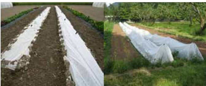
Fig. 9. Row covers are used to protect crops from insects and can be placed directly over the crop and secured with soil (left) or over hoops and secured with clips and rocks (right) 7 .

Floating Row Covers. Row covers are white, light-weight fabrics made from spun-bonded polyester or polypropylene. They are permeable to light, water, and air. Row covers are used to cover plants to create a physical barrier against pest insects, diseases, and some environmental stresses, such as frost (Fig. 9). In addition, row covers can be used to extend the growing season by conserving heat.