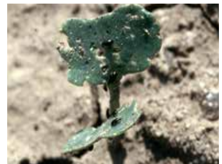
Fig. 6. Flea beetles can be economically damaging to seedlings 4 .

Leafy mustard greens are at high risk for unsightly shotholes and scars that can reduce marketability; however, for mature or less sensitive plants, more than 20% of the leaf area must typically be damaged before yields are reduced. In contrast, seedlings and small transplants are at high risk for damage, especially under heavy infestations (Fig. 6).