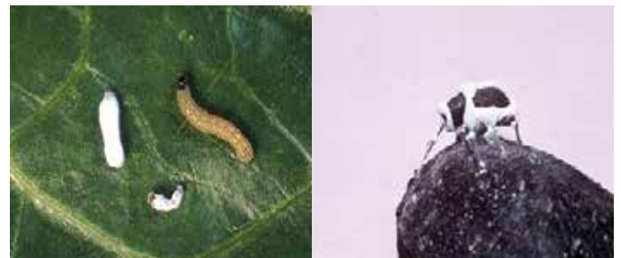
Fig. 10. White muscadine, caused by the fungus Beauveria bassiana , can affect both larval and adult stages in many insects. A healthy armyworm next to two dead armyworms infected with B. bassiana (left) 8 . White muscadine on an adult pecan weevil (right) 9 .

Fungal Pathogens. White muscadine, a disease that can reduce flea beetle populations, is caused by the fungus Beauveria bassiana . When insects come into contact with the fungal spores, the spores attach to the insect, germinate, and penetrate the insect's body. The fungus releases toxins that liquefy the internal contents of the insect, creating a food source for the fungus and subsequently killing the insect (Fig. 10). Since sunlight can dry out and kill spores, applying commercially formulated B. bassiana products in the evening and in humid conditions will improve their efficacy.