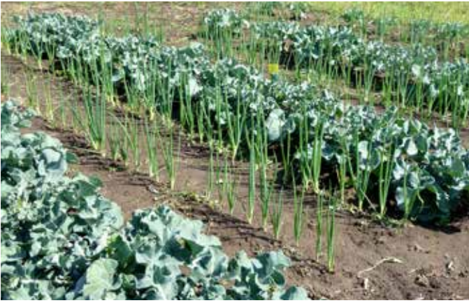
Fig. 8. Example of spring onions (companion plant) being used to repel flea beetles away from broccoli 6 .

Mulches. Living mulches are crops that can be inter-planted with or under-sown in a cash crop. These mulches can obscure host plants from flea beetles and provide habitats for ground-dwelling beneficial insects such as predatory ground beetles. Plants that are commonly used as living mulches include legumes such as clover and vetch. Non-living mulches such as barley straw, leaf mulch, and plastic mulches (e.g., weed barrier and landscape fabric), interfere with the root and soil stages of flea beetles, and may also inhibit adult egg-laying.