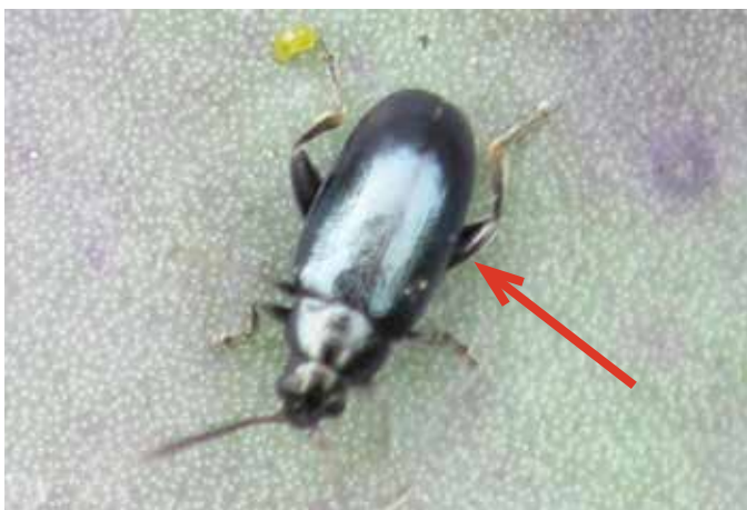
Fig. 1. Flea beetles have enlarged femoral hind legs and jump when disturbed.

Flea beetles are common and problematic in Utah. They are present in late spring and early summer on many vegetable crops and ornamental plants. Adult flea beetles are small, shiny insects that have enlarged hind legs, allowing them to jump great distances when disturbed (Fig 1). They are strong fliers, moving into crops from neighboring fields and weedy borders.