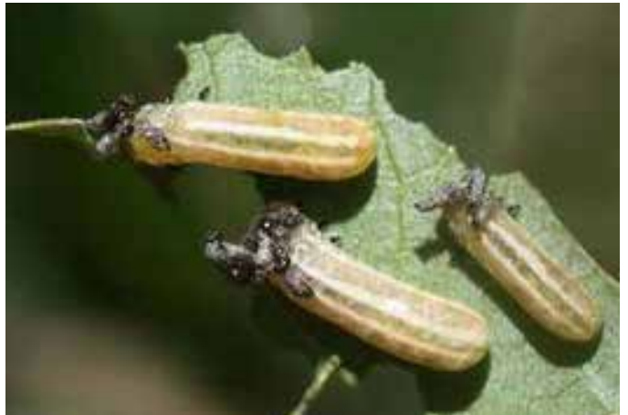
Larvae of sumac flea beetles are grayish, with a cylindrical body form. They are slightly shiny and carry frass (insect feces) containing toxins derived from their sumac host on their back. The larvae use the frass as a shield to protect themselves from ants and other predators 12 .