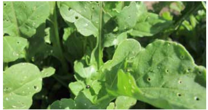
Fig. 4. Flea beetle injury appears as roundish holes characteristically known as "shotholes."

Flea beetle adults use visual and chemical olfactory (smell) cues to find host plants. They chew holes or pits into leaves and cotyledons. On plants with thinner leaves, such as mustard and potato, adult feeding causes small, rounded holes characteristically described as "shotholes" [1/16 to 1/8 inch (1.5 to 3.2 mm) in diameter] (Fig. 4). On plants with leaves that are waxy and thick, such as broccoli, injury appears as pitting (Fig. 5).