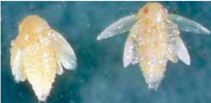
Fig. 3. Flea beetles pupate in the soil and emerge as adults in mid-spring to mid-summer 3 .

Most flea beetle species overwinter as adults in protected places such as under leaf litter, dirt clods, or on weeds along field borders and ditch banks. Adults become active in mid-to late spring and feed on weeds and other available plants. When their preferred host plants become available, and/or when weeds dry up, the adult flea beetle will move to nearby fields or vegetable gardens.