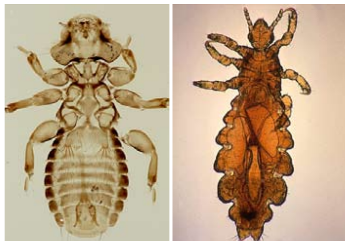
Fig. 1. Chewing louse 1 (left) and sucking louse. 2

Lice infestations on humans, called pediculosis, is very common worldwide. Lice can transmit disease and are parasitic insects on humans, pets and livestock. Lice belong to the order Phthiraptera and are generally divided into two groups based on mouthparts and feeding preferences. Chewing lice (Mallophaga) have well developed mandibles and eat skin, feathers, and fur from birds and mammals (Fig. 1). There are 2,650 species of chewing lice in the world. Chewing lice have broad heads and appear to have cheeks wider than the shoulders. Sucking lice (Anoplura) look similar to chewing lice except they have narrow heads (Figs. 1-2). Sucking lice feed on the blood of mammals. There are about 550 species of sucking lice in the world. There are three types of human lice: head, body and pubic.