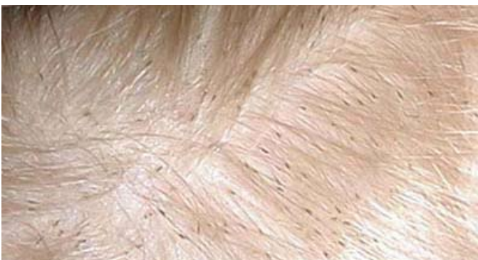
Fig. 4. Many lice eggs near the scalp. 3