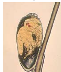
Fig. 5. Louse egg, or nit, glued to a hair. 2

MYTH: Using a lice shampoo will immediately kill lice.