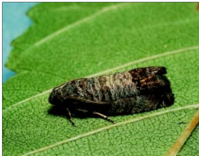
Adult Codling Moth