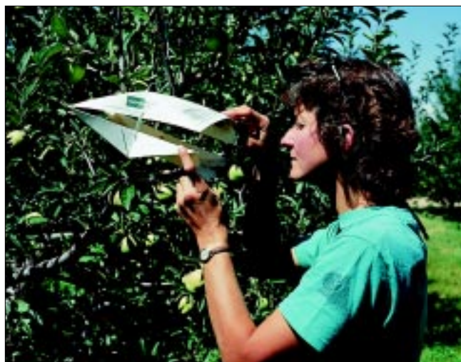
Wing style pheromone trap is used to monitor adult male activity.