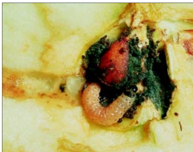
Larva tunnels to the core to feed on developing seeds.

In Utah, there are typically two generations of codling moth per year. In southern Utah and in years with a long and warm summer, a partial third generation can occur. First generation moths begin to emerge about bloom time and peak in late May to mid-June in northern Utah. Second generation moths begin emerging in early July and peak in mid-July to early August.