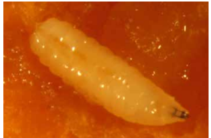
Fig. 7. Close-up of walnut husk fly larva. Note the tapered head with two black mouth hooks.