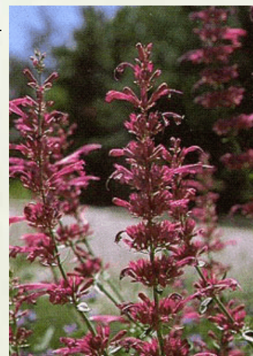
Hyssop/Agastache ( Agastache cana )