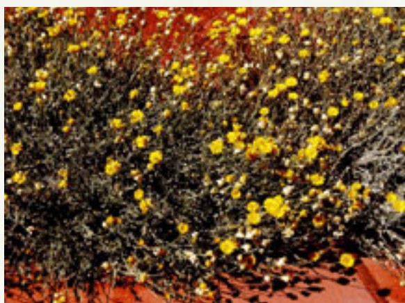
Desert Marigold ( Baileya multiradiata )