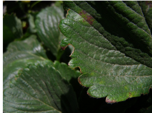
Image 7. Strawberry root weevil damage. Characteristic scallop feeding pattern.