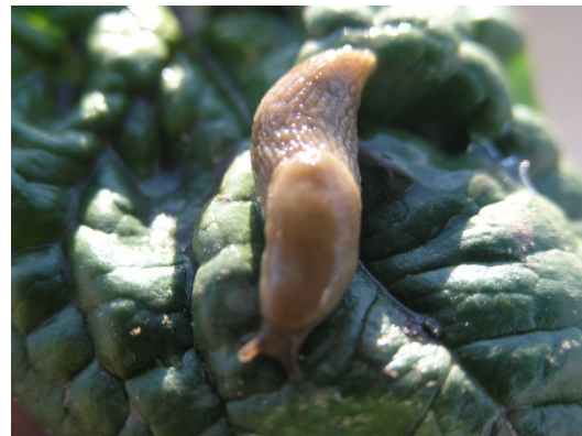
Image 5. Slug on a spinach leaf.