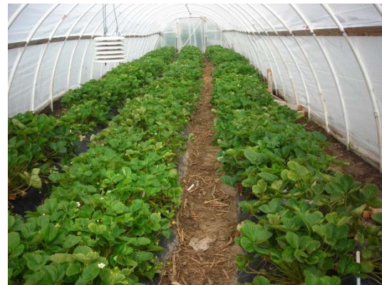
Image 3. Strawberry high tunnel production on raised beds.