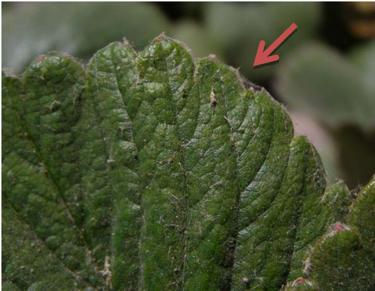
Image 6. Mite webbing on leaf. Plants are often stunted by mite feeding.