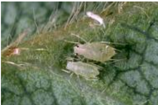
Image 4. Aphids on the bottom of a strawberry leaf.