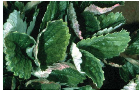
Image 8. Upward curling of strawberry leaves infected with powdery mildew.

Most modern cultivars have some level of disease resistance. Using resistant cultivars reduces the need for expensive chemical disease control. Cold winter temperatures slow the growth and spread of disease, making disease incidence rare in winter production, but as temperatures rise in the spring, diseases become more common. Because of the humid, cooler conditions that are present within high tunnels in late fall and early spring, fungal diseases can become a problem.