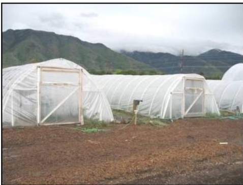
Image 1. High tunnel constructed with PVC and wood frame.

In recent years, the use of high tunnels for extending the growing season has become fairly widespread. High tunnels operate and look like greenhouses (Image 1), but are passively heated and cooled which helps keep operating costs low. They are temporary structures typically constructed with galvanized steel, PVC pipe, or wood framing and covered with greenhouse grade plastic. Even without additional heating, high tunnels can be 15-30°F warmer than the outside air temperature during the day. This temperature increase extends the growing season earlier into the spring and later in the fall. Extending the season can significantly increase the amount of produce grown, increasing profits. In areas where season extension is not as critical, high tunnels are often used for rain exclusion and wind protection. Following is an outline of integrated pest management for high tunnel strawberries; however, the concepts presented hold true for many high tunnel fruit and vegetable crops.