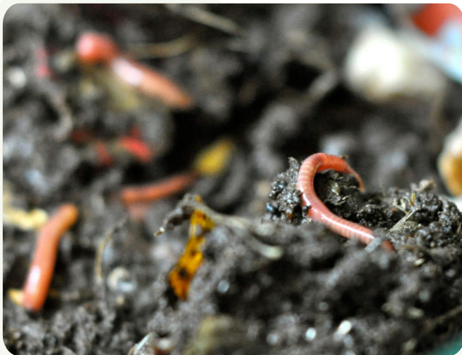
Worms can consume their own weight in food EVERY DAY!

Vermicomposting, or worm composting as it is more commonly known, is the process of using worms to break down discarded food and other organic wastes and convert them into compost and liquid fertilizers. Not only will this process save you money, but it will also downscale your environmental footprint. Vermicompost systems can be purchased online or assembled cheaply by up-cycling materials found around the house or at a local thrift store.