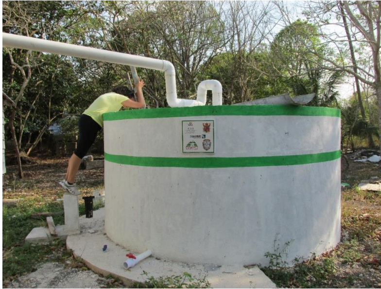
Figure 2. A pileta , with a pipe to direct rainwater from the house roof.

Calakmul today than when they moved to the frontier 30 or 40 years ago and there was less infrastructure to ensure a year-round water supply. However, with more frequent droughts and less annual precipitation, water shortages remain a source of vulnerability.