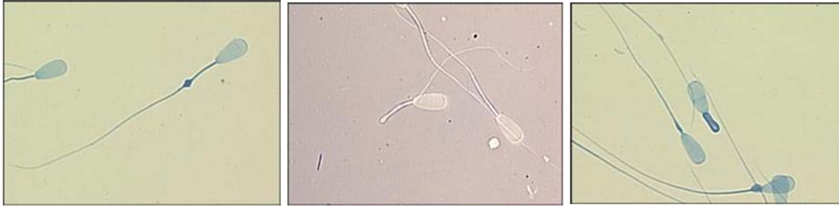
Photos 4-6. L to R. Distal cytoplasmic droplet. Bent tail or midpiece. Coiled midpiece/tail in one sperm and proximal cytoplasmic droplet in another.

Examples of secondary abnormalities are proximal or distal cytoplasmic droplets, bent tails, coiled tails and bent midpieces. See examples below.