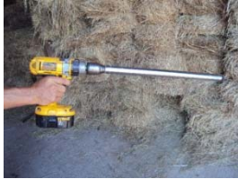
Figure 14. Feed core sampler

Minerals have been deposited in soils over countless years. The amounts and types of each mineral found in Utah soils will vary considerably. The amount of mineral contained in a sample of forage is dictated to a large degree by the concentration of the mineral that was available in the soil as it grew. There is usually a direct correlation between the mineral concentration in the soil and plant material that is grown in that soil (ZoBell, 2000).