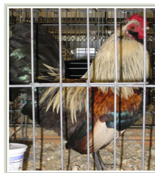
Figure 1. Examples of a well-bedded cage and a well-groomed Black Rosecomb hen and Old English cock.