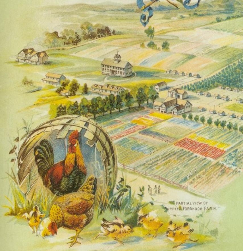
PARTIAL VIEW OF BURPEE'S FORDHOOK FARM."