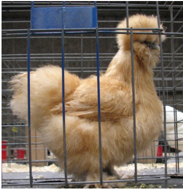
Figure 1. Examples of well-groomed chickens.