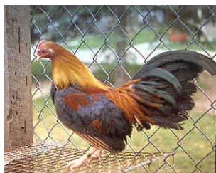
Figure 2b. Wheaten Old English Game cock.