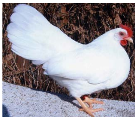
Figure 2a. White Rosecomb hen.