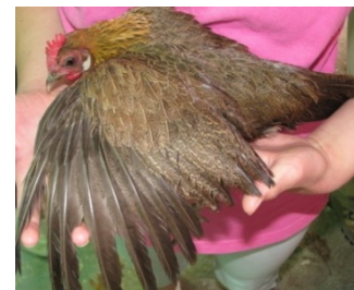
Figure 4. Proper way to examine the wing.