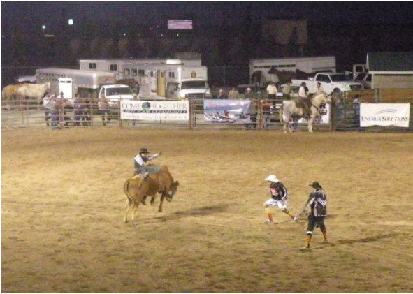
Figure 6 This motion shot in a dark setting would not be clear if not for the higher ISO adjustment.