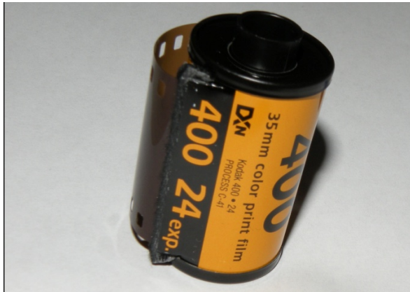
Figure 4 This roll of 400 speed film had 24 pictures that needed to be shot before changing it.