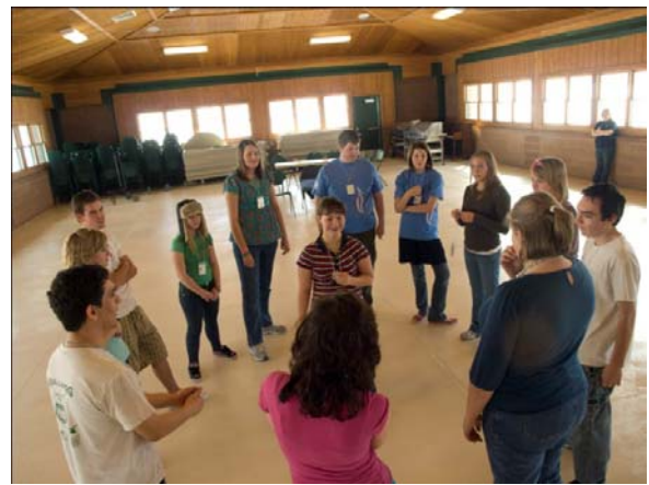
Figure 5 A flash may be distracting or inappropriate in certain settings, so photographers adjust the film speed. The film speed was set at 800 for this photo.

Another common case for adjusting the film speed is at an event like a wedding. A flash will interrupt the event so adjusting the film speed is critical. In this case adjusting the film speed helps to maintain the atmosphere without sacrificing the mood associated with a wedding reception (Figure 5).