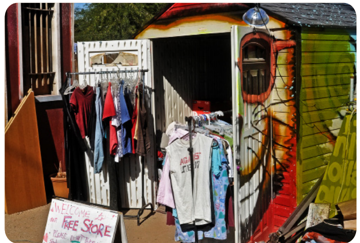
A freestore can be designed in various sizes, but it is generally best to start small.

The Baltimore Freestore uses this system to “collect unwanted goods and redistribute them to people who want them. It’s pretty simple. We are trying to change the way people view their relationship to their goods, their community and their earth. Though we target low-income neighborhoods to distribute goods, there are no requirements for shoppers; the