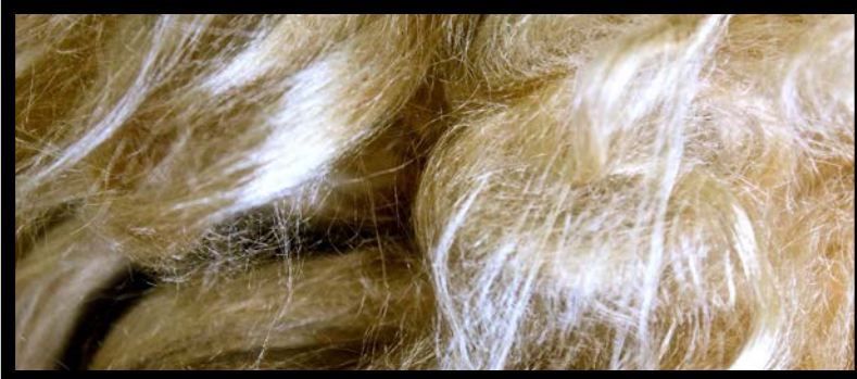
Figures 1 and 2: Tussah silk fiber.