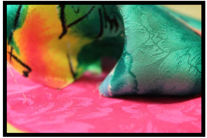
Figures 3 and 4: Silk fabric.