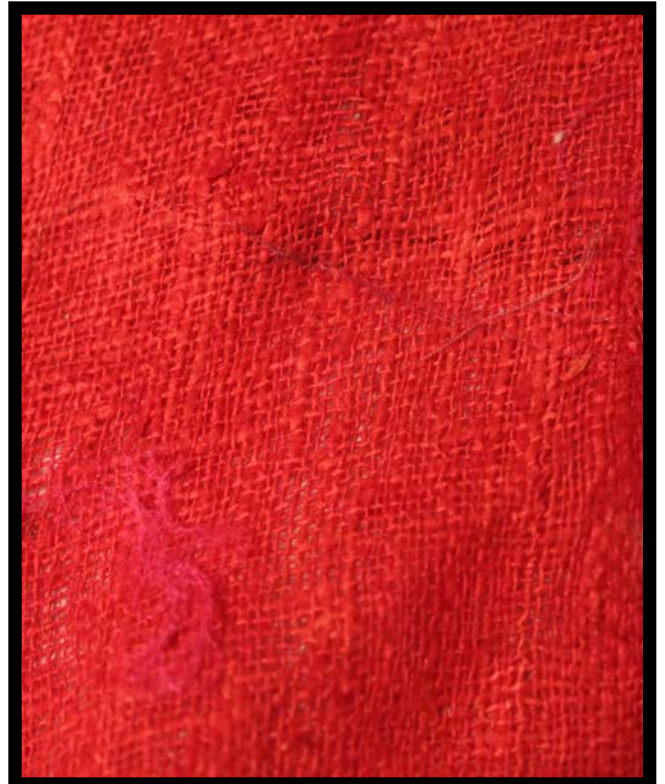
Figure 3: Raw silk fabric.

Tussah silk is “wild” silk, or silk from worms not specifically bred to produce silk. This fiber tends to be less uniform and shorter in length. Further, it is a light brown color rather than the white silk produced by sericulture worms. Duoppioni or dupion is also common and is created when two worms form a cocoon together, resulting in fibers that vary in thickness and colors (Cohen & Johnson, 2010).