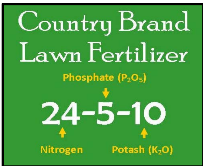
Figure 2. An example of a typical lawn fertilizer label.

Once soil has been tested and lawn use has been determined, the next step is to select an appropriate fertilizer blend. Fortunately, all fertilizers are required to prominently display a three number formula (Figure 2) on their packages. These numbers are the percentages (by weight) of N, phosphate ( P_2O_5 ) and potash ( K_2O ). For example, a lawn fertilizer with an analysis of 24-5-10 contains 25% N, 5% phosphate and 10% potash. This means a 50 lb bag of this particular product contains 12 pounds of N, 2½ lbs of phosphate, and 5 lbs of potash. All three nutrients are involved in many physiological processes of plants. The rest of the weight of the fertilizer is made up of other elements such as carbon, hydrogen, and oxygen within these compounds.