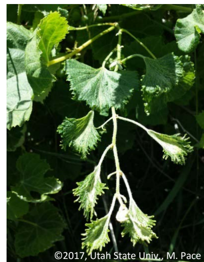
Photo 5. Herbicide damage on grape. Note the stunted, twisted growth of the leaves.

Weeds compete with grapevines for nutrients and water. To obtain maximum production, weeds must be controlled. Eradicating hard to kill perennial weeds such as dandelions, crabgrass and field bindweed before planting will greatly reduce weed issues in the coming years. Grapes are very susceptible to systemic broadleaf herbicides used in lawns, such as 2,4-D and dicamba. Exposure to herbicides results in stunted cane growth, deformed leaves and non-uniform fruit development (Photo 5). 2,4-D damage may occur from spray applied