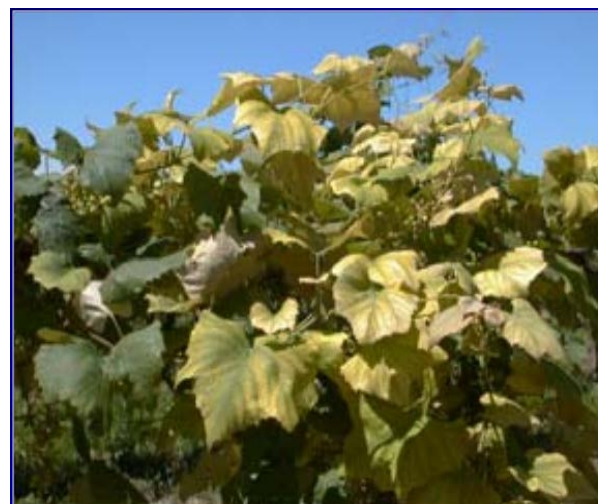
Photo 4. Iron deficiency in grape leaves with interveinal yellowing while veins remain green.

In Utah’s alkaline soils, grapes are prone to iron deficiency, especially in heavy clay soils or in plants that are being over-irrigated. This is recognized by leaves that have turned yellow but the veins remain green (Photo 4). If left untreated, the leaves may turn completely yellow and eventually brown along the edges. To combat iron deficiency, apply a spring application of iron chelate to the soil around the plant. Spraying a solution of iron chelate on the leaves can be a short-term remedy in severe situations. Excessive irrigation, particularly in the spring, increases the plants risk of iron deficiency. For more information reference USU’s Iron Chlorosis in Berry Crops fact sheet.