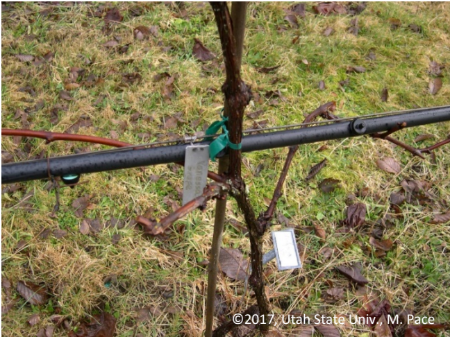
Photo 2. Grape vine irrigated by drip irrigation system. The line is attached to the trellising wire.

weather conditions. Reduce irrigation in the late summer and early fall to help the plant harden off for winter. Drip irrigation (Photo 2), or furrow irrigation should be used if possible. Using sprinklers to irrigate will wet the leaves and increase the risk of diseases. If late summer and fall precipitation is minimal and soils become dry, irrigate grapes just before the ground freezes to minimize winter injury from drying of the roots. See the companion fact sheet, “Grape Irrigation,” for an in-depth explanation of irrigation amount and timing.