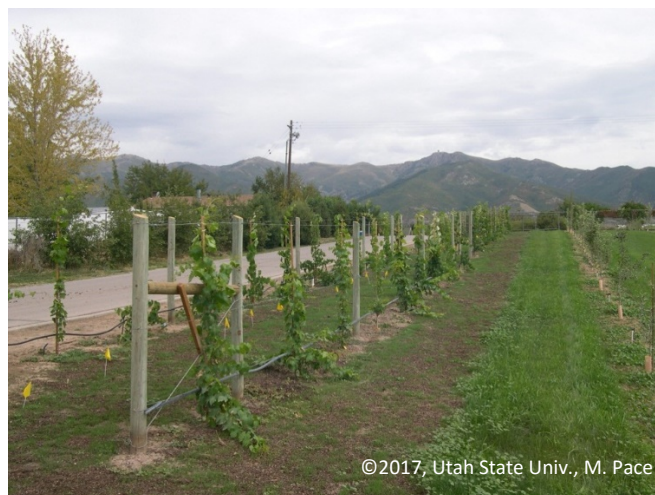
Photo 1. One-year-old grape planting trained to 2-wire Kniffen trellis system.

least 4 feet wide that is free of weeds and turf should be maintained around the base of each plant. Mulching around the new planting will help control weeds. Grapes can be planted in the spring or fall, but local nurseries and online sources will have a better selection of plants in the spring of the year. Do not allow young vines to dry out, particularly if planting bare-root stock. For best results, dig a hole twice as wide and as deep as the roots of the grape plant. If planting a bare-root plant, carefully spread the roots out in the hole and cover with soil to the previous soil line that should still be visible on the trunk. For container-grown plants, plant at the same depth as in the nursery pot. It is important to immediately water the plants in after planting to settle the soil around the roots of the plant and add more soil if needed, to bring it up to the correct soil level.