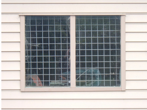
Figure 3. Placing a few window decals is not enough to break up the entire reflection (top). Instead, decals, tape, string, or other materials should be placed in a tight grid to better break up the window reflection (bottom).