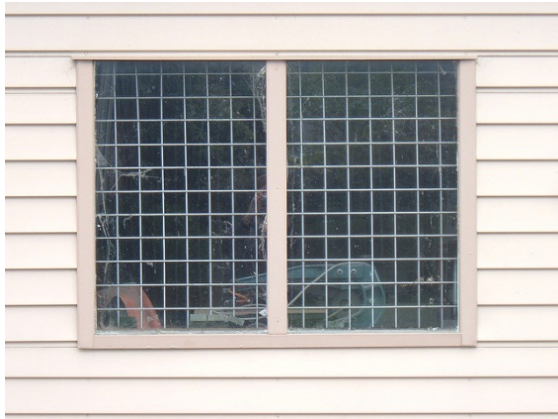
Figure 3. Placing a few window decals is not enough to break up the entire reflection (top). Instead, decals, tape, string, or other materials should be placed in a tight grid to better break up the window reflection (bottom).