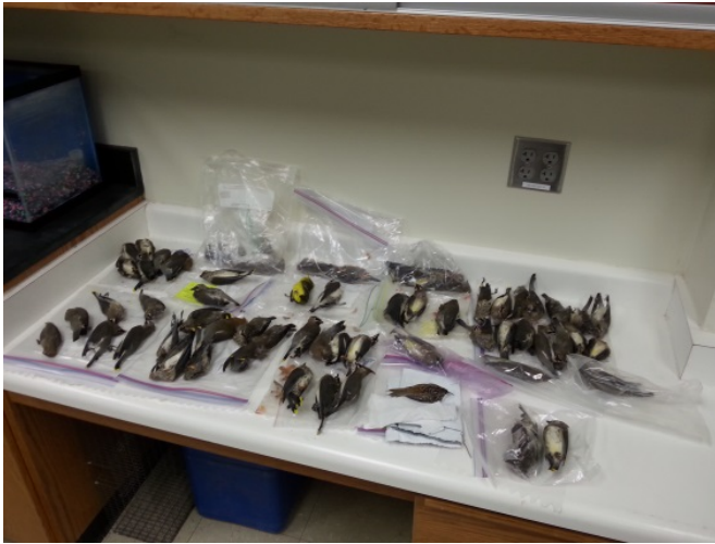
Figure 2. Over 60 Cedar Waxwings were killed by colliding with the Utah State University Inn over the span of 2 days in the Fall of 2015.

gather in these trees to feast on the berries. When a predator appears, huge flocks can be scared, flying into the windows, thinking that the transparency or reflections of trees and sky offers escape (Figure 2).