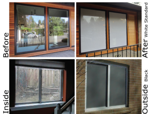
Figure 4. Various patterned films designed to prevent bird window collisions. Films are transparent on one side and reflective on the other.