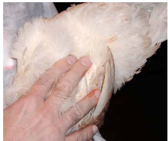
Figure 4. Pelvic spread in a non-layer (two fingers in width).