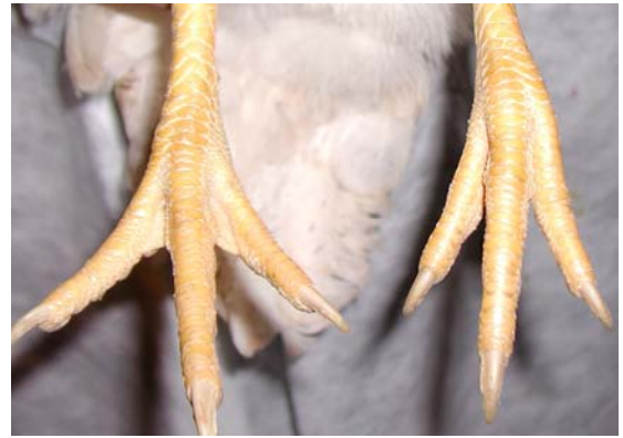
Figure 2. Hen early in the egg production cycle. Note extensive yellow pigmented shanks and toes.