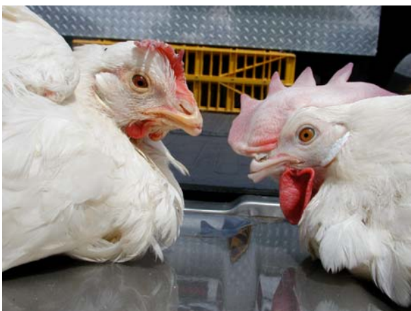
Figure 1. Non-layer (left) vs. hen in production (right). Compare eye ring and beak color, and comb and wattle size.