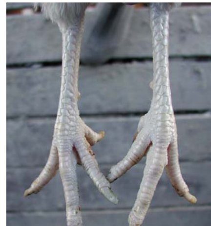
Figure 3. Shanks and toes of a hen that has been in egg production greater than 20 weeks. Note the extensive loss of pigment.