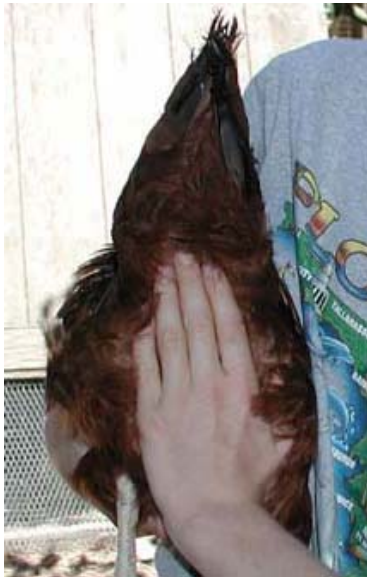
Figure 5. Pelvic spread in a hen in production (four fingers in width).