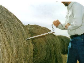
Figure 15. Core sampling of a round bale

The concentration of a given mineral in a sample of plant material can be determined in a laboratory. Laboratories are available to perform tests conveniently and economically. A sample of plant material should be tested from every field producing feed for livestock. This should be done every 5 to 7 years since mineral levels will vary depending on the soil type and the application of fertilizer. Feed samples should be taken from the feeds that are being fed to the cattle along with clippings from pastures and sent to the laboratory for analysis. Feed