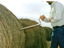
Figure 15. Core sampling of a round bale

The concentration of a given mineral in a sample of plant material can be determined in a laboratory. Laboratories are available to perform tests conveniently and economically. A sample of plant material should be tested from every field producing feed for livestock. This should be done every 5 to 7 years since mineral levels will vary depending on the soil type and the application of fertilizer. Feed samples should be taken from the feeds that are being fed to the cattle along with clippings from pastures and sent to the laboratory for analysis. Feed