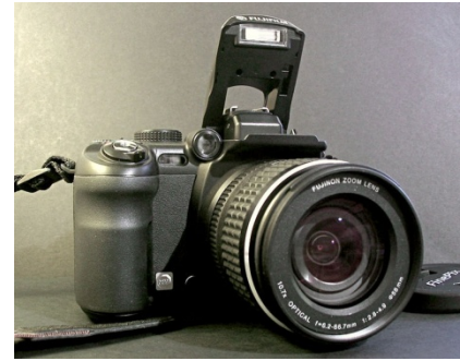
Figure 9 A modern digital camera.

Today cameras can record detailed images of fast moving objects. Figure 9 is a fairly sophisticated camera that is available to consumers that uses a memory card to record images instead of film.