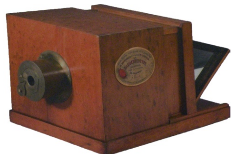
Figure 2. An early Daguerreotype Camera.

Light sensitive paper was developed in the early 1800s and photographs were taken using silver compounds to record an image. Early cameras were able to record images of still objects directly onto the paper, but the size of the picture was determined by the size of the film. The early commercial cameras, such as this Daguerreotype Camera, could not adjust the lens or enlarge photos from film.