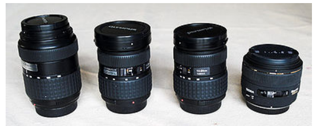
Figure 7. These lenses show the different types that are available for use in normal circumstances, telephoto, or wide angle.

Arguably, lenses may be the most critical component of the camera. The first lenses were mostly suitable for landscape photography. Improvements made it possible to take good portraits as long as the subject remained very still. During the 1860s the Single Reflex Lens (SLR) was invented. This lens made it possible for the same camera to use multiple types of lenses. The development of various compound lenses makes it possible to take telephoto, wide-angle, macro, and standard photographs. A good quality lens provides the photographer a lot of flexibility.