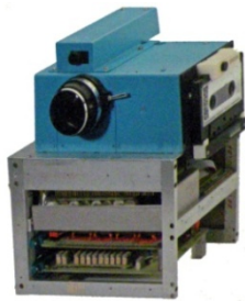
Figure 8 The first digital camera.

In 1973 Steven Sasson, an engineer for a major camera company, invented the world's first digital camera. It took 23 seconds to record a 10,000 pixel photograph. (Most cameras today can take pictures 800-1,000 times larger.) The picture was recorded onto a cassette tape and was very blurry. However, the camera shown below has served as a prototype that has revolutionized the way pictures are recorded and edited.