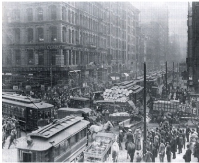
Figure 4. Downtown Chicago, IL, Circa 1880.

In the 1870s new advances in chemistry led to the ability to capture subjects in motion. Cameras were equipped with a fast moving shutter that could open and shut in a fraction of a second. It was now possible to capture the image of a crowded street such as this scene in Chicago in the 1880s.