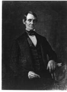
Figure 3. An 1847 portrait of Abraham Lincoln.